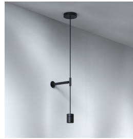
CODE: 1184009 FINISH: MATT BLACK