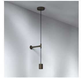
CODE: 1184011 FINISH: BRONZE

TO MAINTAIN THIS PRODUCT TO ITS BEST CONDITION, PLEASE VIEW OUR CARE AND CLEANING GUIDE ON THE SUPPORT SECTION OF THE ASTRO WEBSITE.