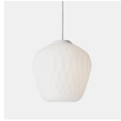
Opal & white