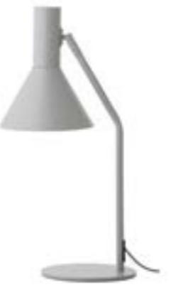
Matt light grey: art.no. 101399