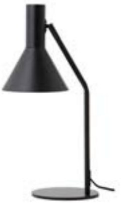
Matt black: art.no. 101401