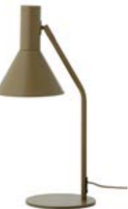
Matt green: art.no. 123040