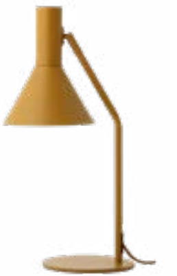
Matt almond: art.no. 101397