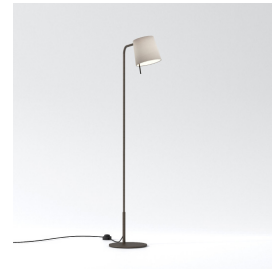
CODE: 1394012 FINISH: BRONZE

TO MAINTAIN THIS PRODUCT TO ITS BEST CONDITION, PLEASE VIEW OUR CARE AND CLEANING GUIDE ON THE SUPPORT SECTION OF THE ASTRO WEBSITE.