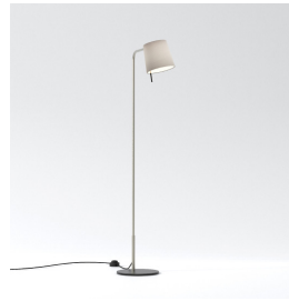
CODE: 1394011 FINISH: MATT NICKEL